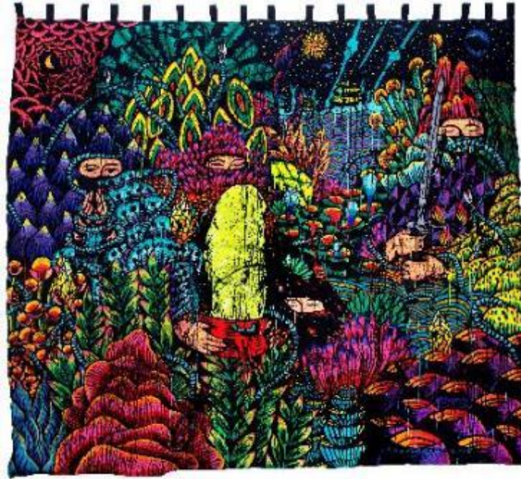
Eko Nugroho, A Pot full of Peace Spells , 2018, Embroidered painting, 275 x 316 cm