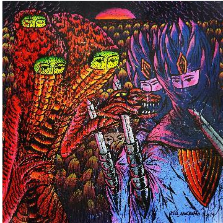
Eko Nugroho, War is Another Meet and Greet Moment , 2019, Acrylic on canvas, 200 x 200 cm