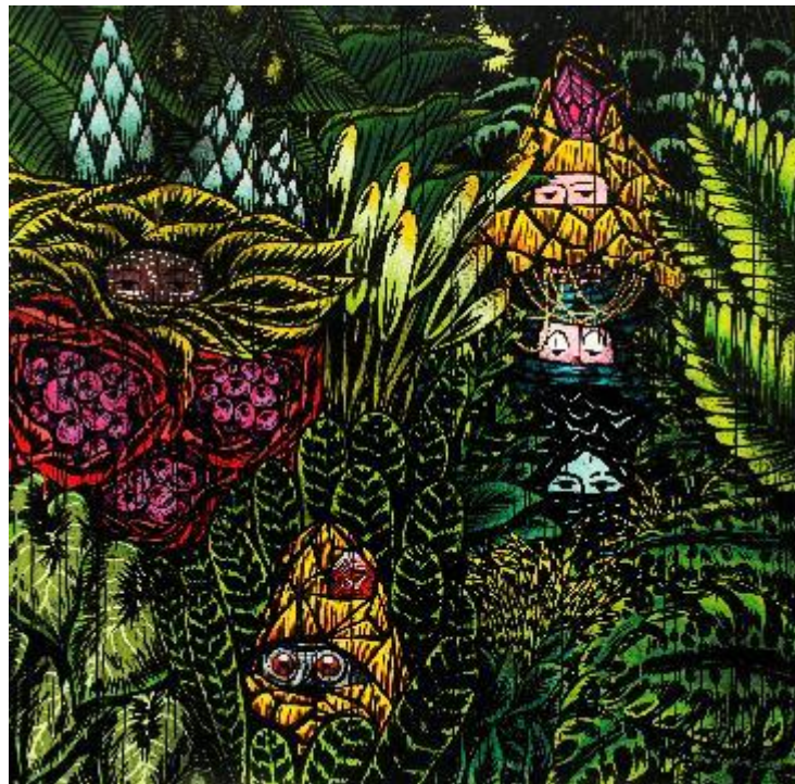
Eko Nugroho, Unity in Hiding #1 , 2018, Acrylic on canvas, 200 x 200 cm