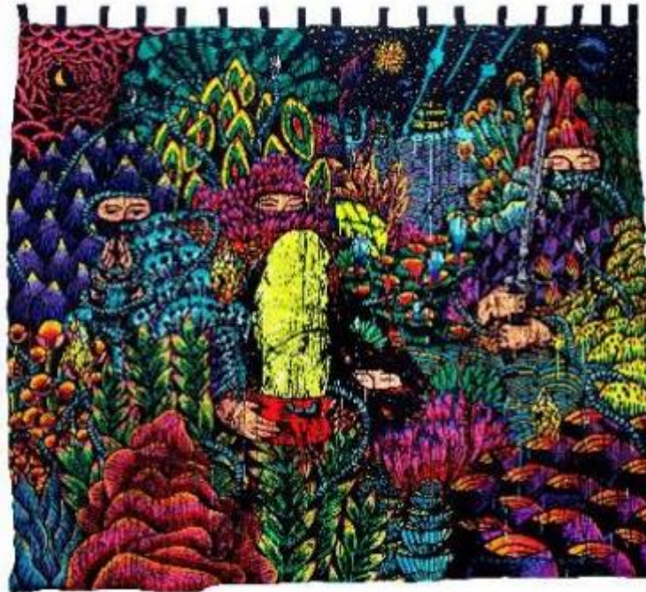
에코 누그로호, A Pot full of Peace Spells , 2018, Embroidered painting, 275 x 316 cm