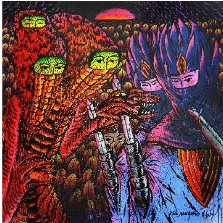
에코 누그로호, War is Another Meet and Greet Moment , 2019, Acrylic on canvas, 200 x 200 cm