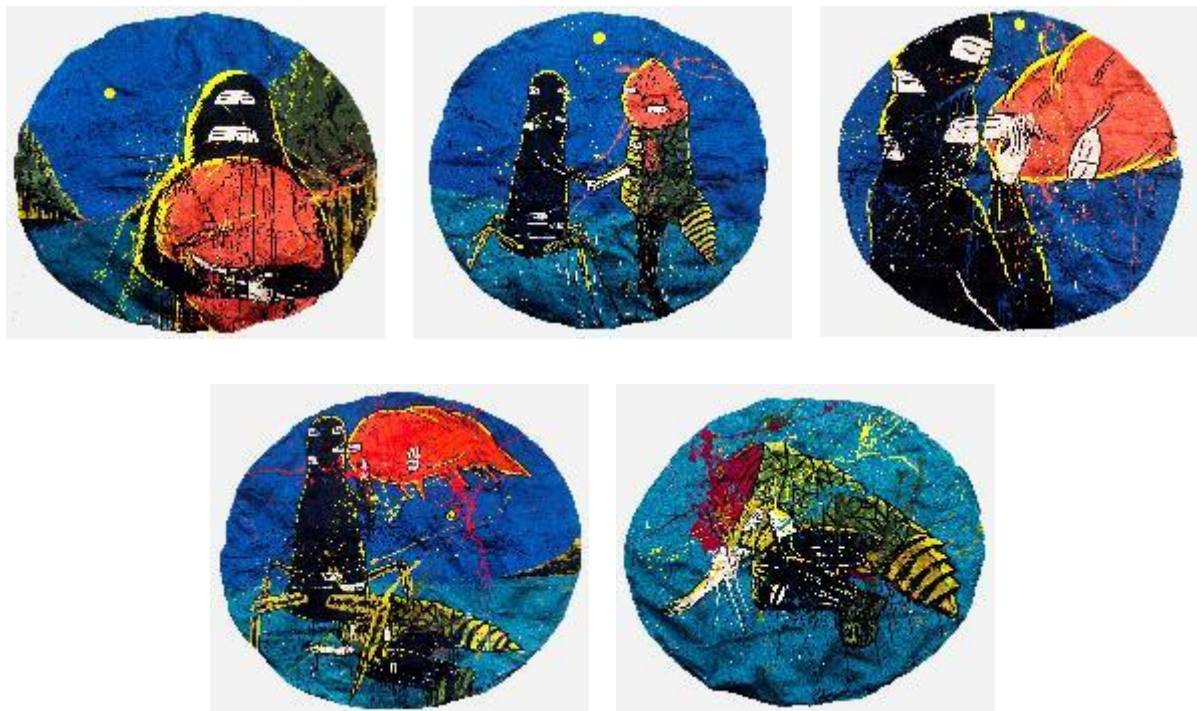
Eko Nugroho, Love #1-5 , 2019, Embroidered painting, 154 x 134 cm; 143 x 134 cm; 136 x 143 cm; 150 x 134 cm; 150 x 130 cm