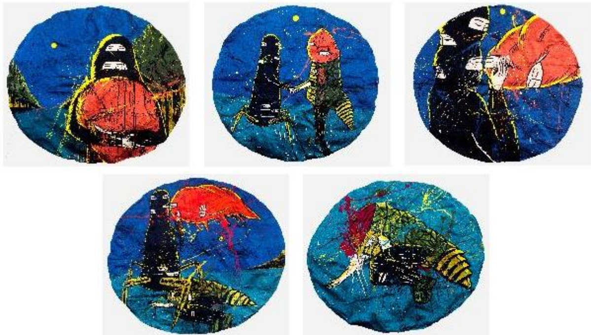
에코 누그로호, Love #1-5 , 2019, Embroidered painting, 154 x 134 cm; 143 x 134 cm; 136 x 143 cm; 150 x 134 cm; 150 x 130 cm